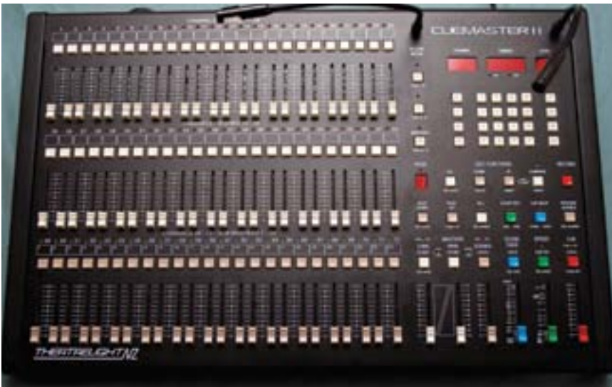
Theatrelight full desk.

observe the lighting state without the monitor destroying your vision.