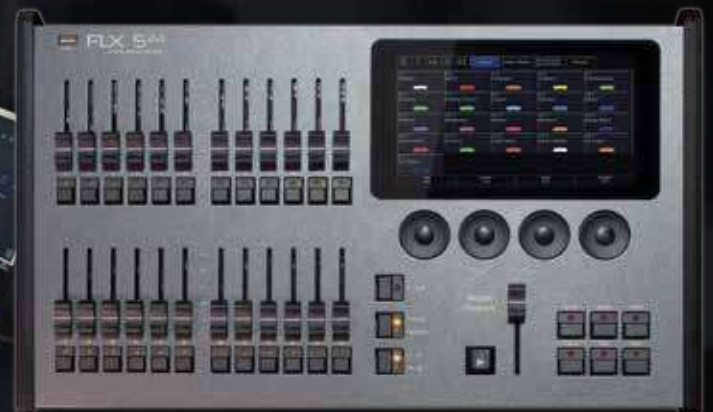
FLX S24 - 48 light fixtures