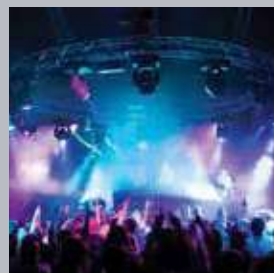
Saturday bands by you