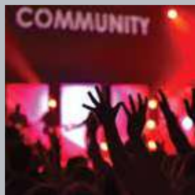
Community events by you