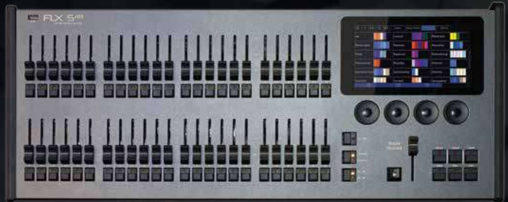
FLX S48 - 96 light fixtures

FLX S consoles are easy to learn and simple to use - delivering all the features you need at an affordable price.