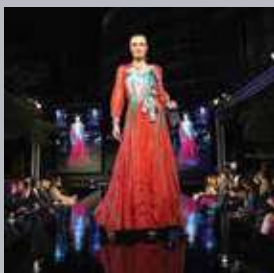
Fashion shows by you