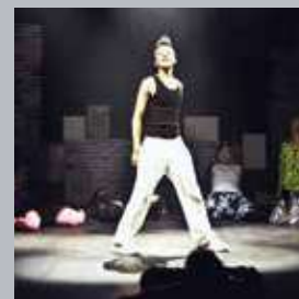
School plays by you