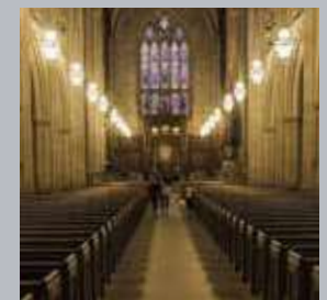
Worship services by you